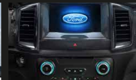
Dual zone electronic automatic temperature control