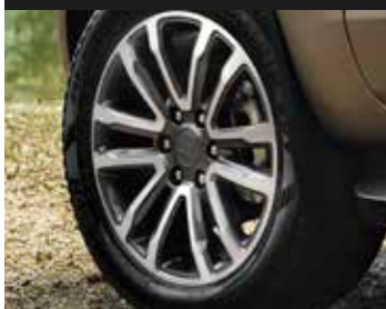
Premium Alloy Wheels