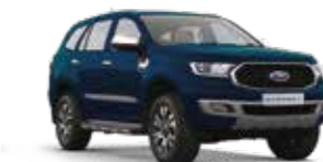
Deep Crystal Blue