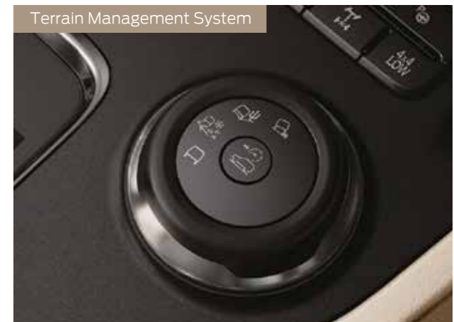
Terrain Management System

Rock - With this mode, keep 4WD in first gear for superior control and tackling rocky terrains.