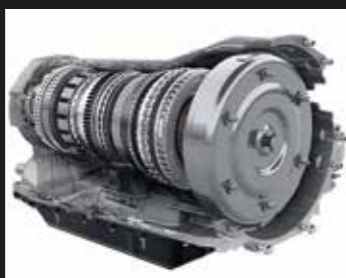
World first 10-speed Automatic Transmission