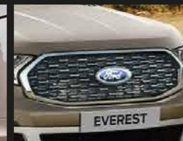
All New Black Front Grille