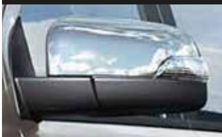
Ebony Black Side Mirrors