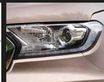
LED Projector headlamps