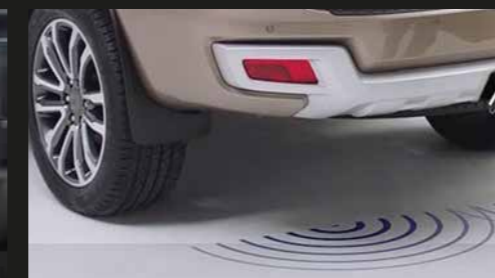
Hands Free Power Liftgate