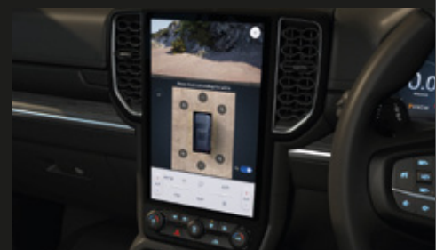
360° View Camera