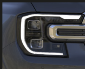
LED Projector headlamps