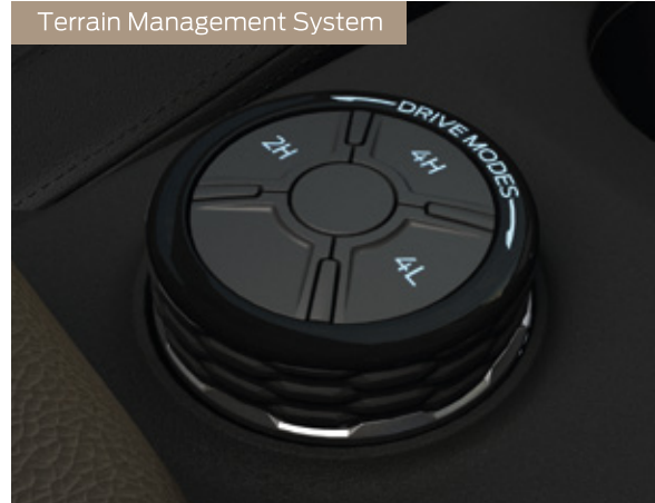
Terrain Management System

Rock - With this mode, keep 4WD in first gear for superior control and tackling rocky terrains.