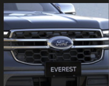
All New Grey Front Grille