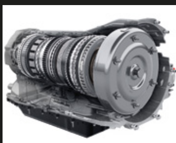
World first 10-speed Automatic Transmission