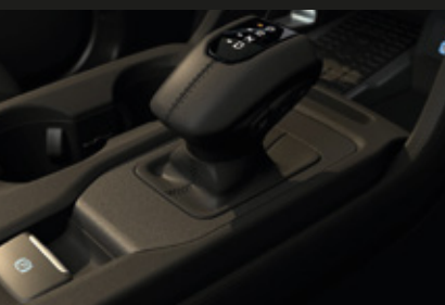
Electronic Parking Break