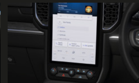
Premium 12" Touchscreen