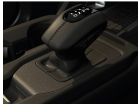
Rear Park Assist