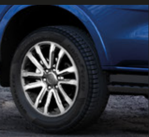
Premium 20" Alloy Wheels